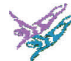
Nova Trampoline Club